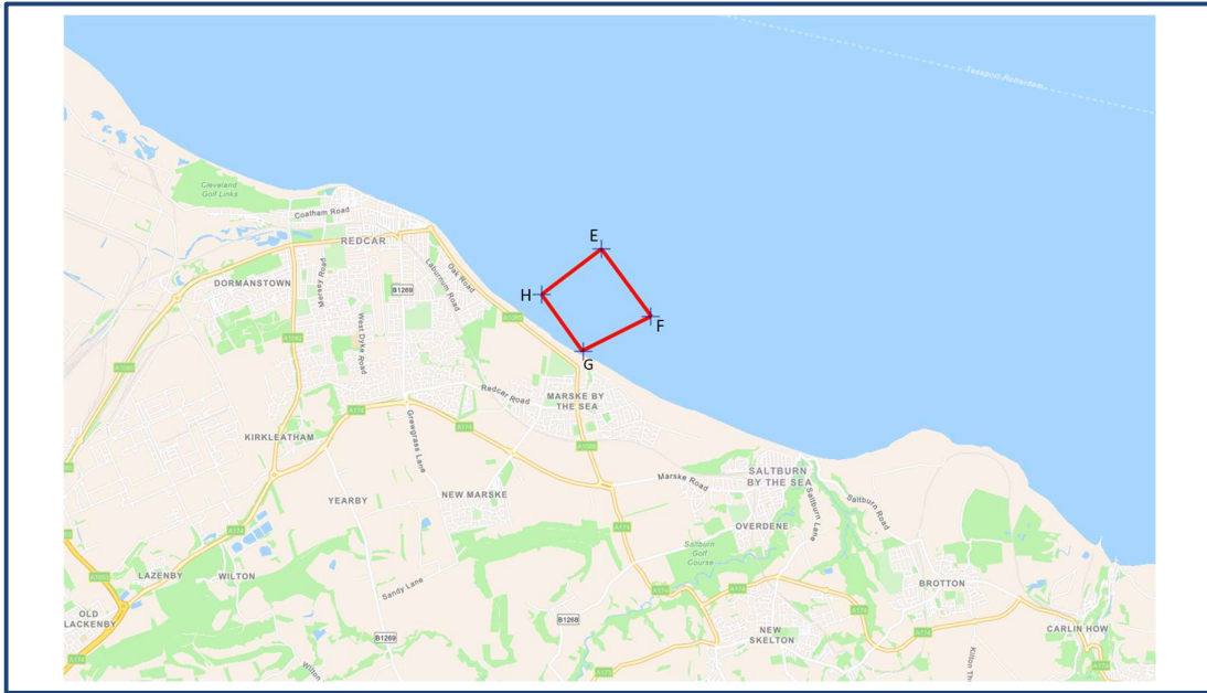
Figure 1: Plan of exclusion area.