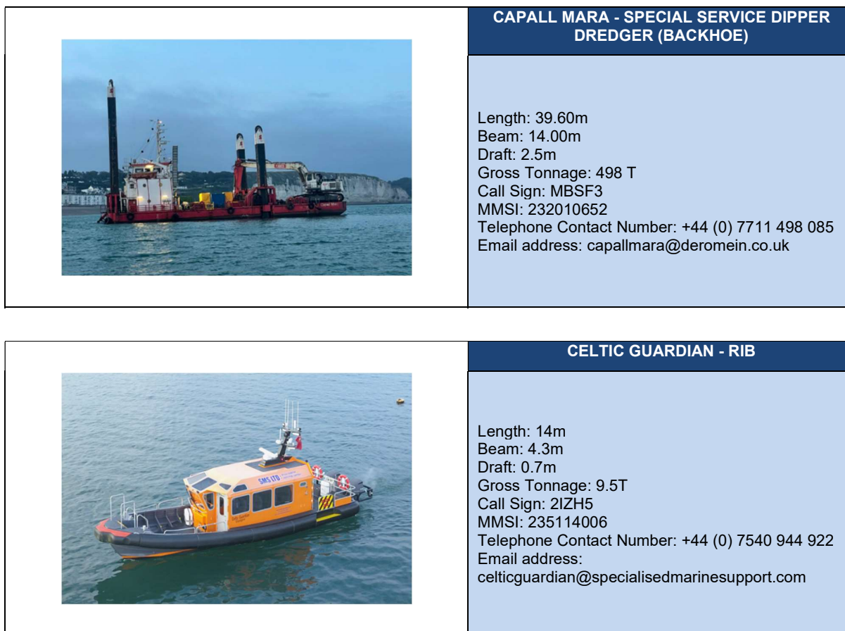
Table 3: Vessel details

Mariners are advised of the following vessels commencing operations at Sofia Offshore Wind Farm (SOWF).