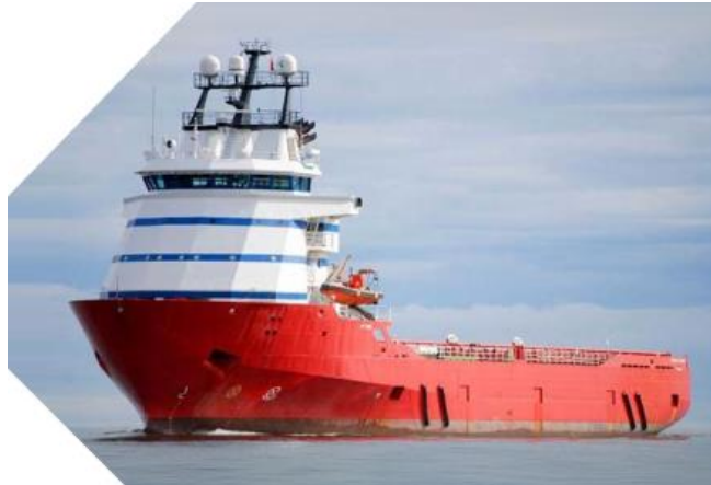
FIGURE 2: M.V. HORIZON GEODISCOVERY

Owner: Gardline Limited Operator: Gardline Limited Call Sign: 3EXS8 ISMO: 9263514 MMSI: 355847000 Flag: Panama Berths: 44