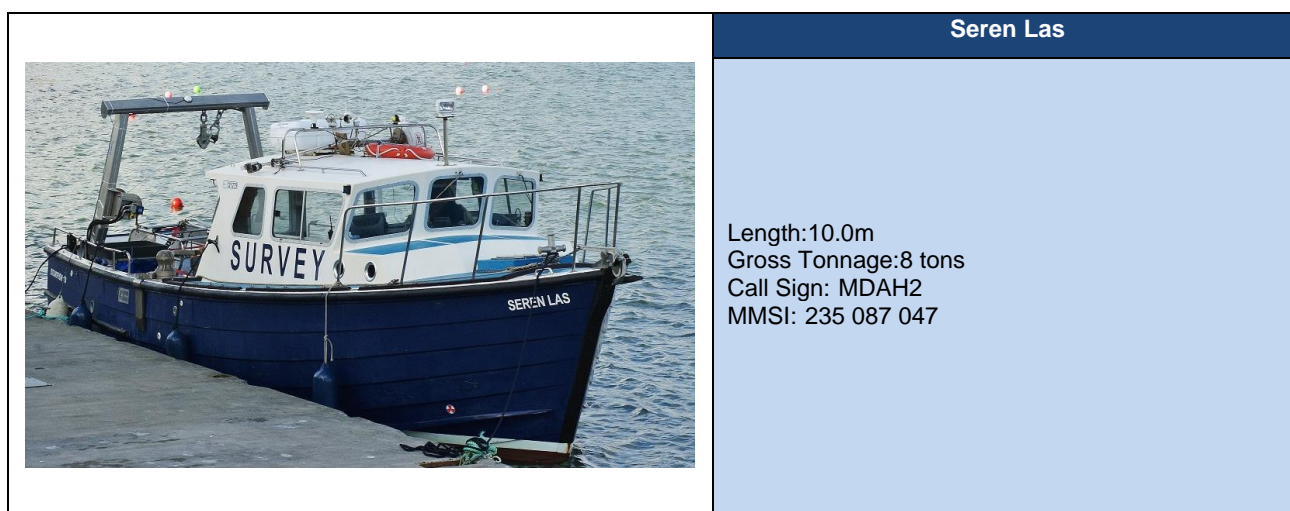
Table 3 Vessel details

Mariners are advised of the following vessels commencing operations at Sofia Offshore Wind Farm (SOWF).